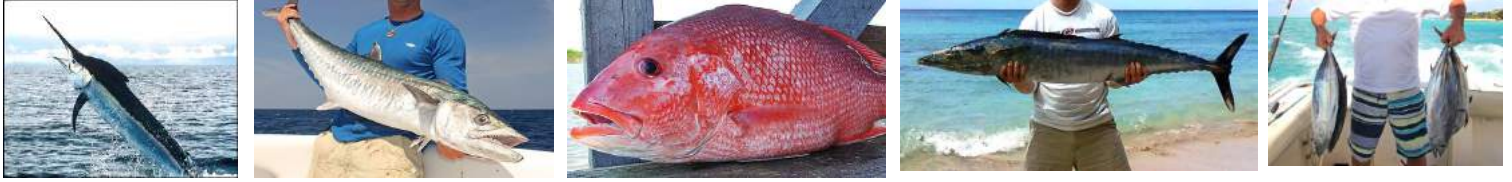
l-r: Blue Marlin, King Fish, Snapper, Wahoo, Tuna

Deep-sea fishing for Jamaica's signature blue marlin, along with mahi-mahi, king fish, snapper, tuna and wahoo, is available with Lady G'Diver ( dive@ladygdiver.com ) or on the 'Irie Vibes' ( info@irievibesfishing.com ). Please observe seasonal catch restrictions. Bring your own lunch and drinks. Each year in October, there is a week-long Blue Marlin Fishing Tournament in Port Antonio, now in its sixth decade and a fun social gathering as well.