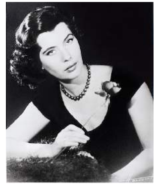
Nina Dyer — Princess Nina Aga Khan